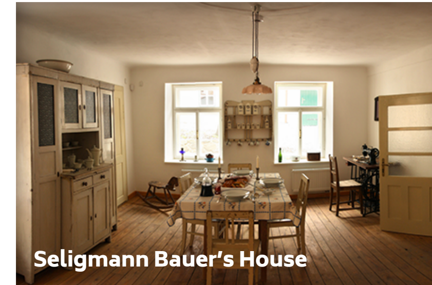
Seligmann Bauer's House