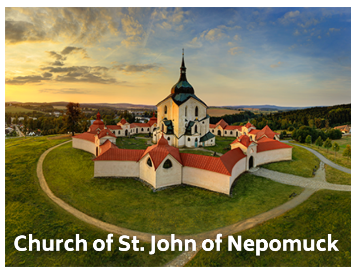
Church of St. John of Nepomuck

Multimedia and interactive exhibition about the history of the establishment of the monastery. The museum was awarded as the Most Creative Museum of Central Europe 2016.