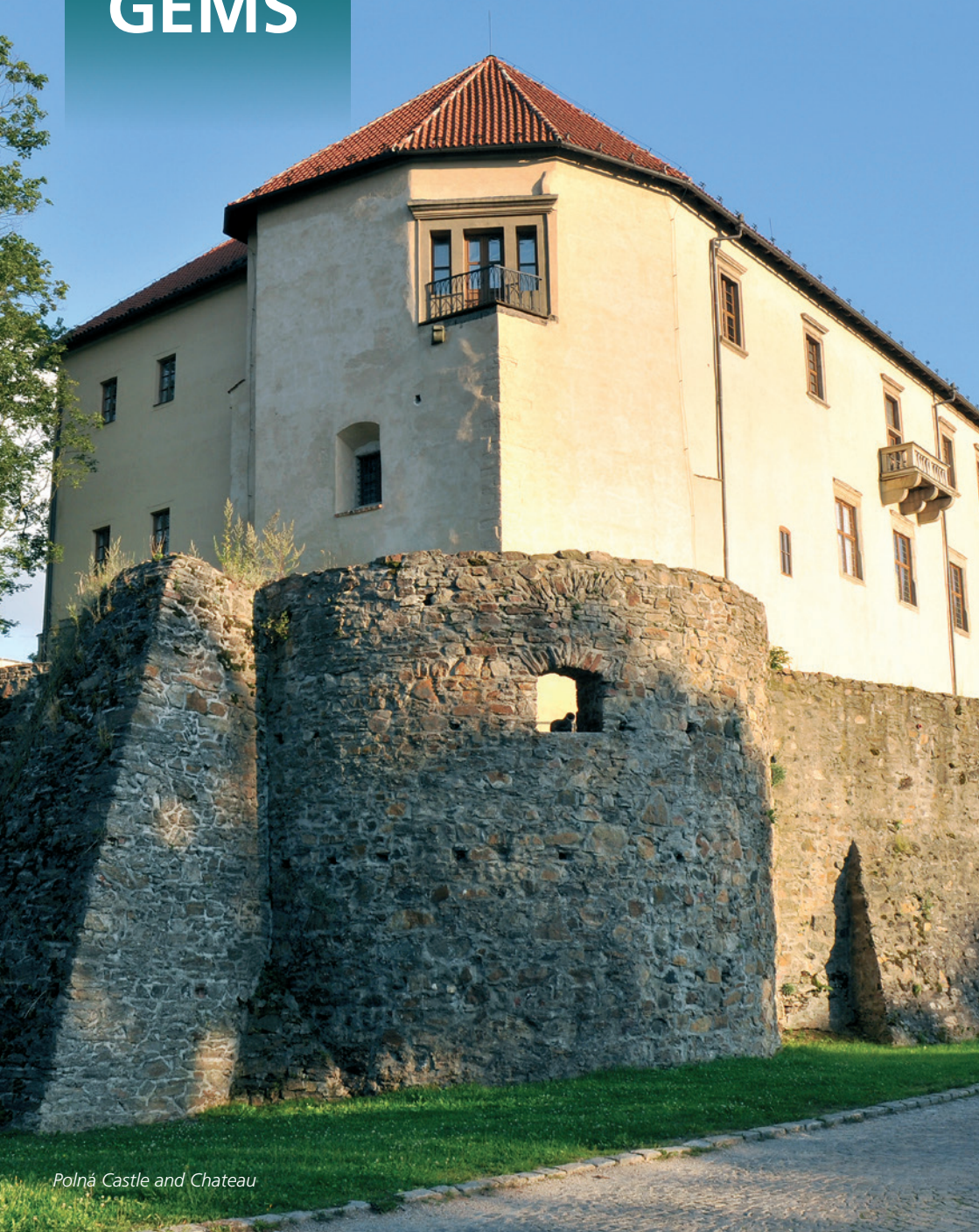
Polná Castle and Chateau