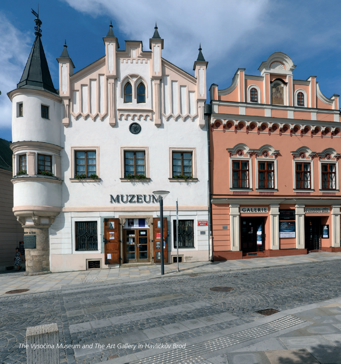
The Vysočina Museum and The Art Gallery in Havlíčkův Brod