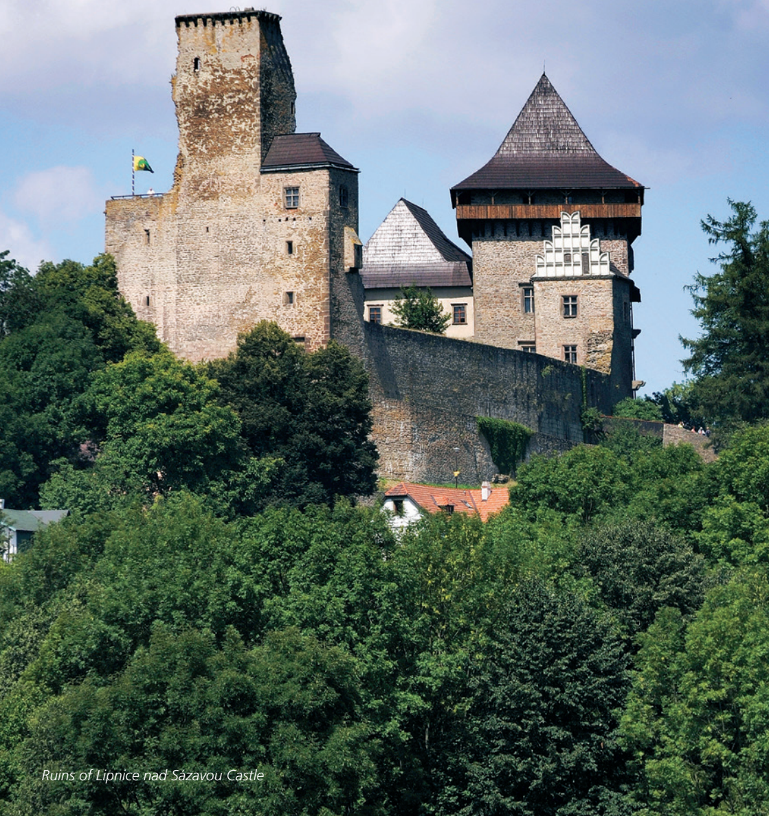
Ruins of Lipnice nad Sázavou Castle