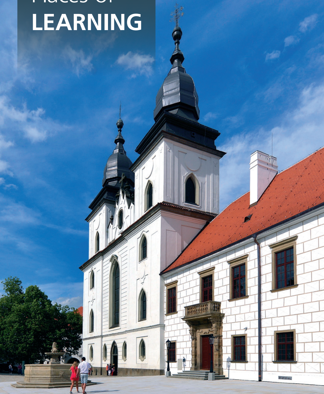
Chateau – Vysočina Museum in Třebíč